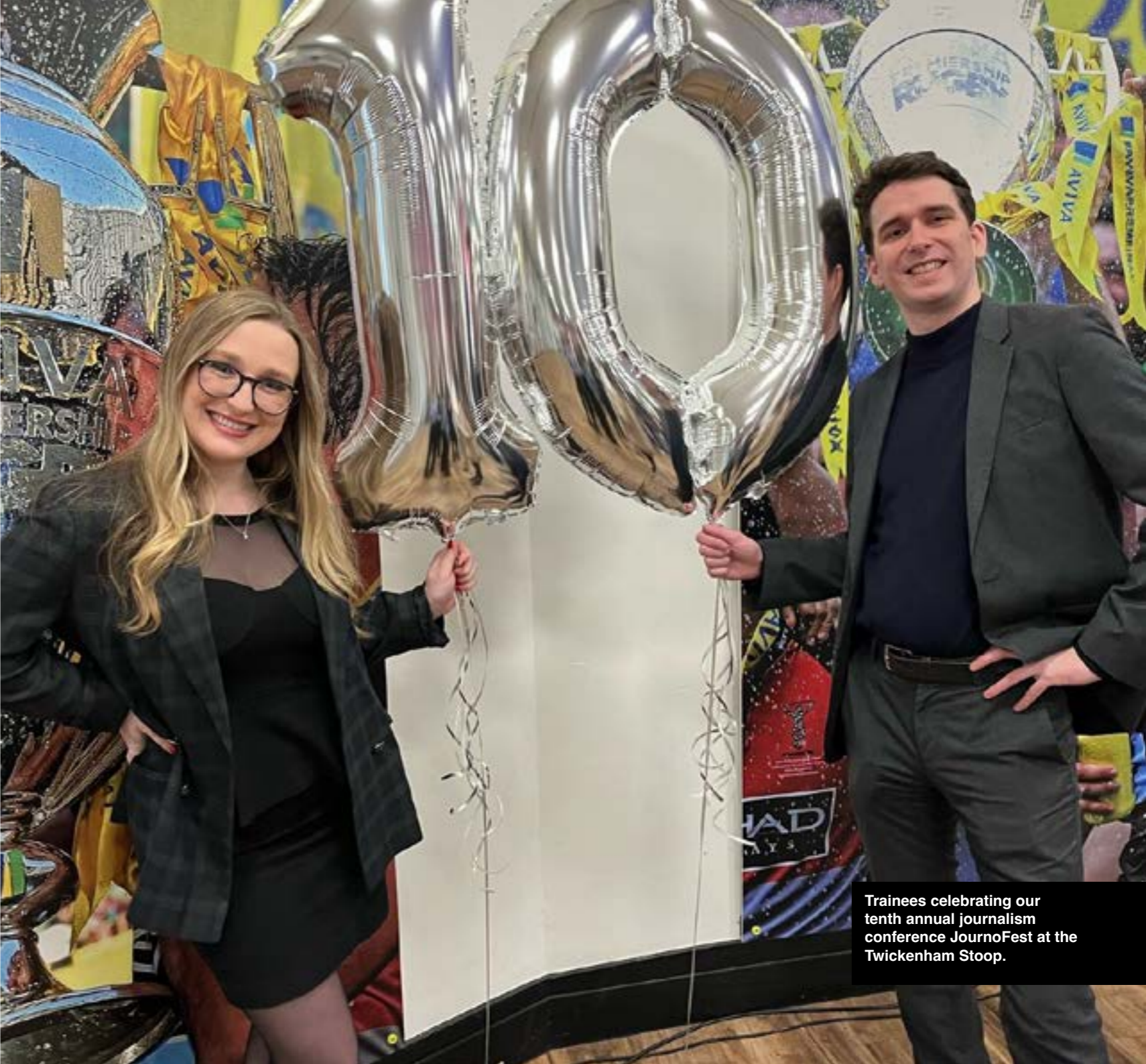
Trainees celebrating our tenth annual journalism conference JournoFest at the Twickenham Stoop.

You are welcome to sit exams with us in London and join us for journalism work placement on Wednesdays, but that is entirely optional.