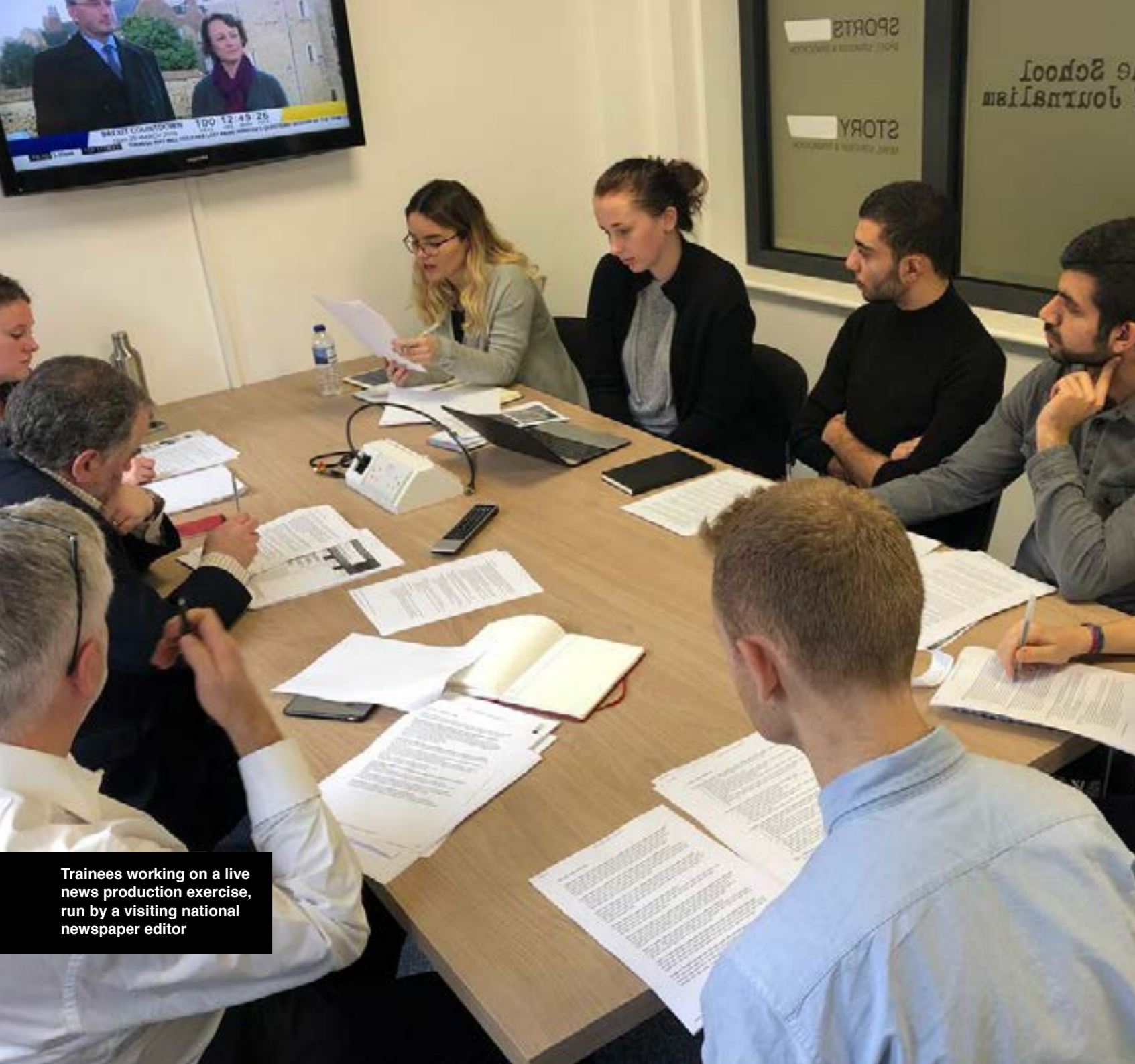
Trainees working on a live news production exercise, run by a visiting national newspaper editor