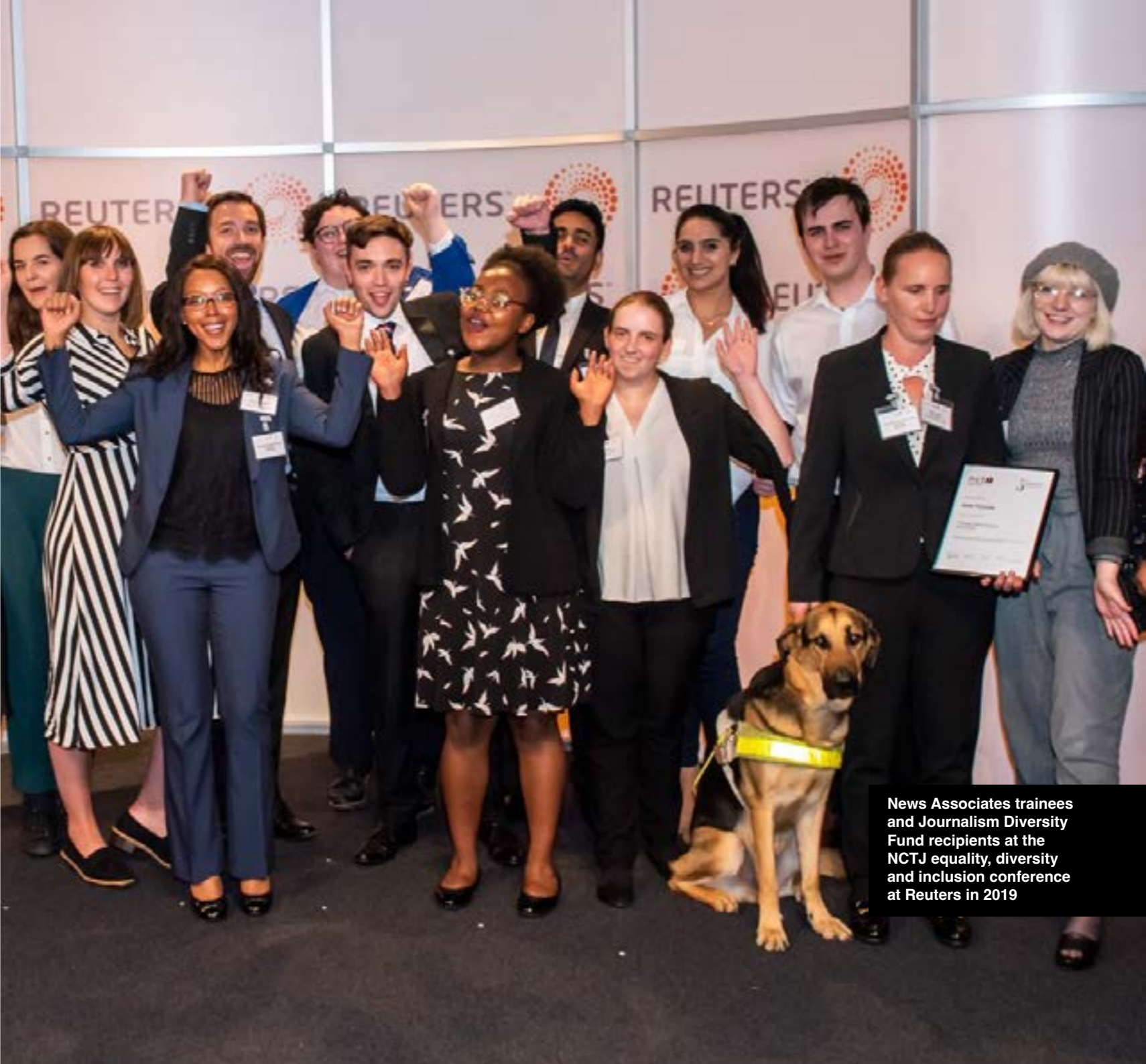
News Associates trainees and Journalism Diversity Fund recipients at the NCTJ equality, diversity and inclusion conference at Reuters in 2019

You can also find us on Twitter, Facebook and LinkedIn.