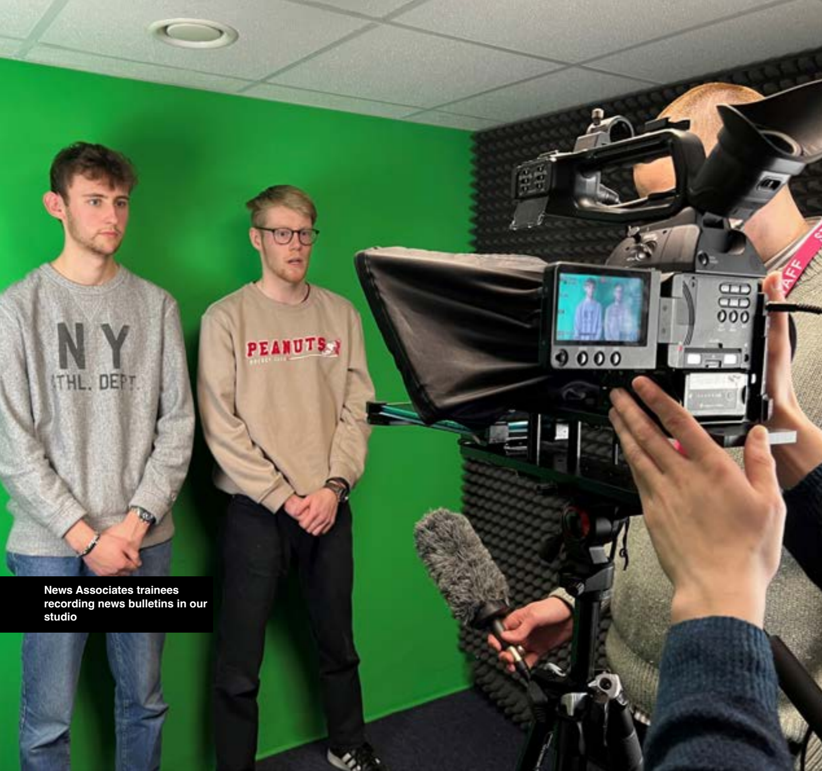
News Associates trainees recording news bulletins in our studio