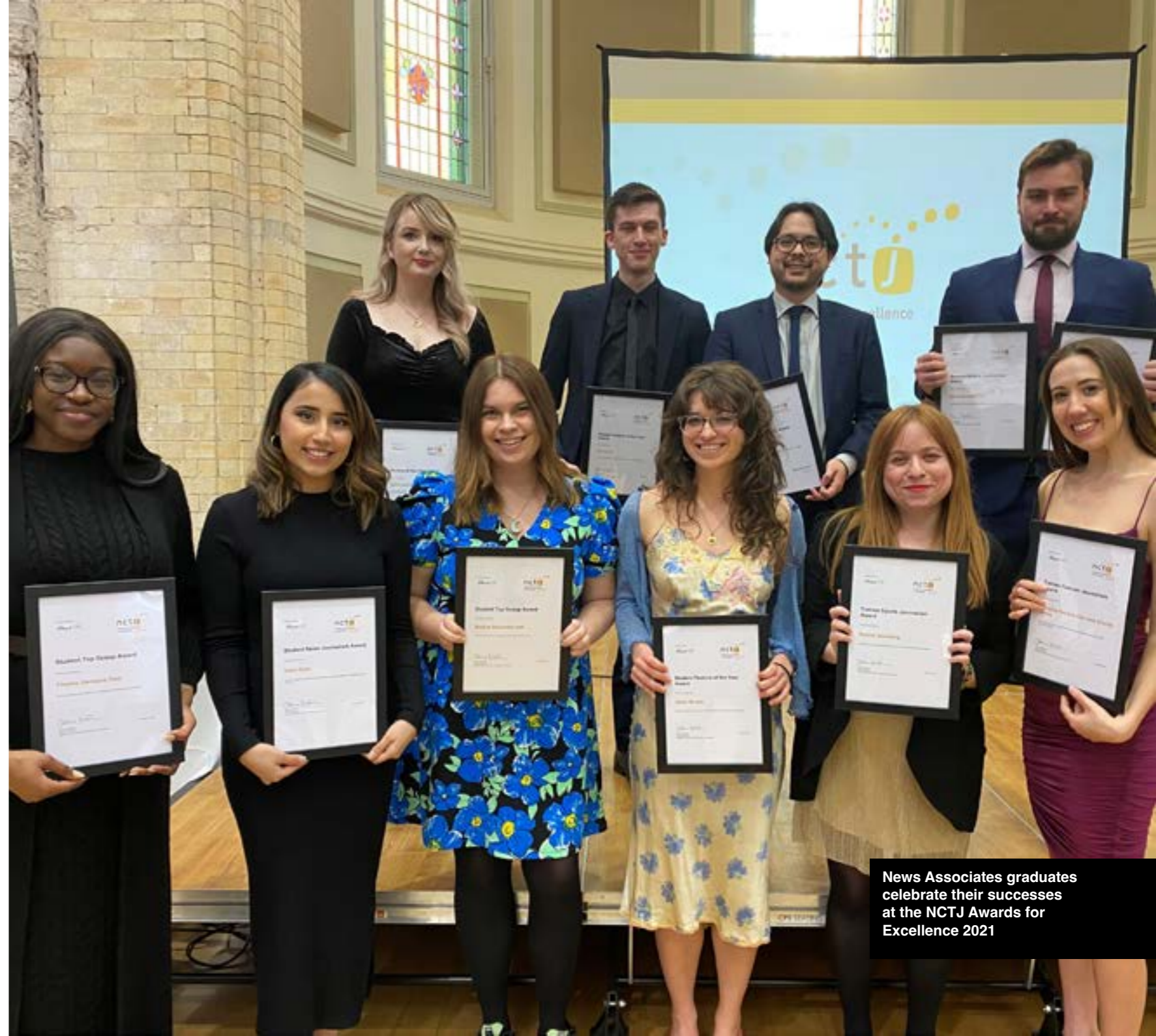
News Associates graduates celebrate their successes at the NCTJ Awards for Excellence 2021

Mandatory modules: data journalism, essential journalism, essential journalism ethics and regulation, essential journalism e-portfolio, essential media law and regulation, introduction to PR for journalists, journalism for a digital audience, public affairs for journalists, videojournalism for digital platforms