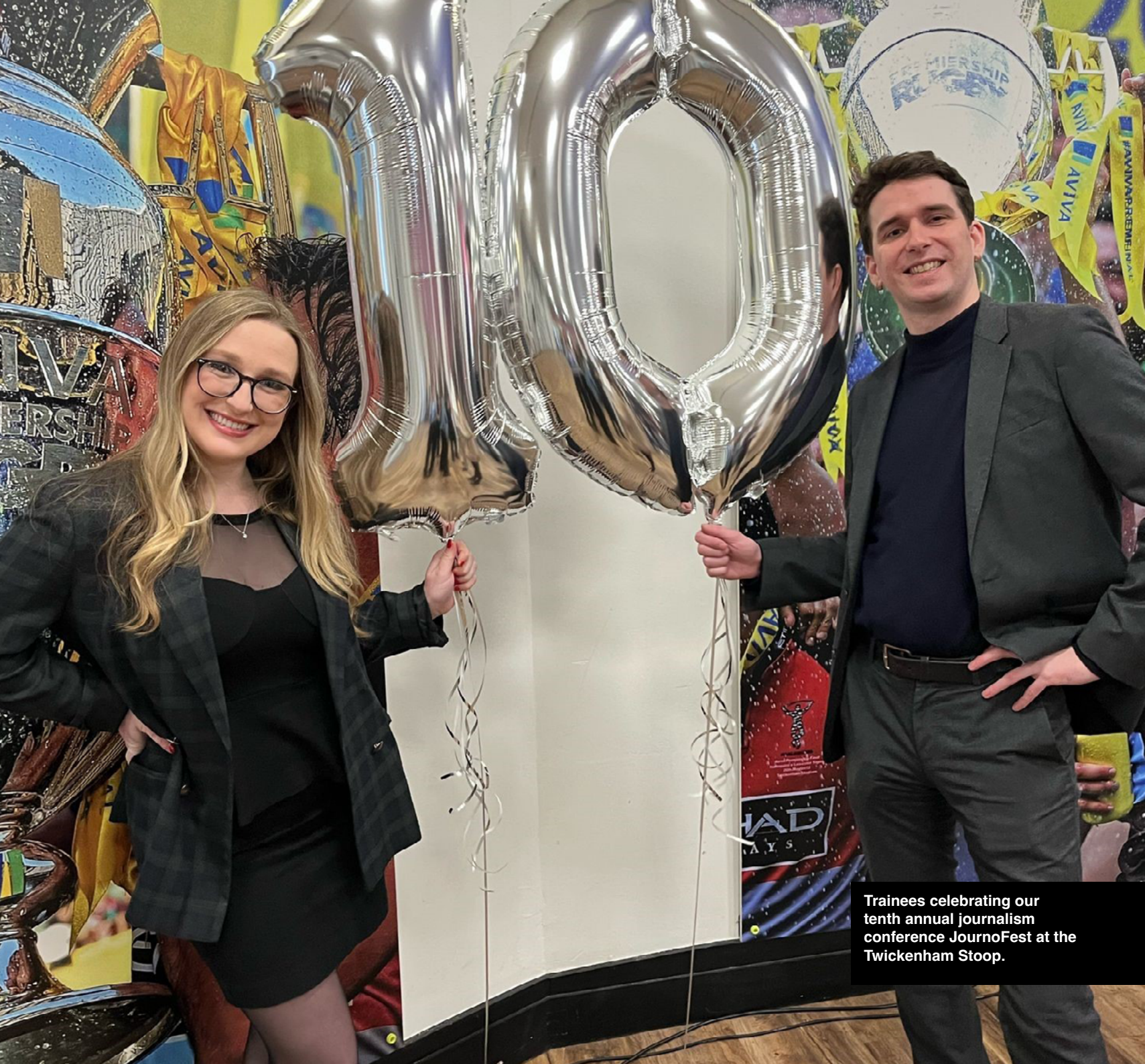
Trainees celebrating our tenth annual journalism conference JournoFest at the Twickenham Stoop.

You are welcome to sit exams with us in London and join us for journalism work placement on Wednesdays, but that is entirely optional.