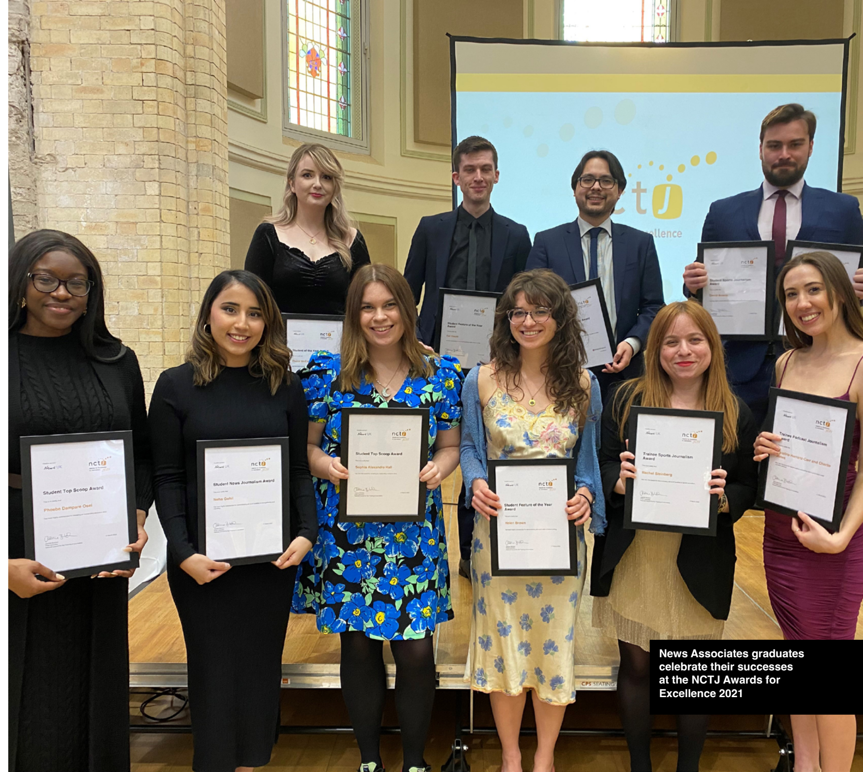
News Associates graduates celebrate their successes at the NCTJ Awards for Excellence 2021

Our remote part-time course has an intake in November. Lessons are held every Tuesday 6:30pm-9:30pm and every other Thursday 6:30pm-9:30pm. This course will be fully taught on Zoom.