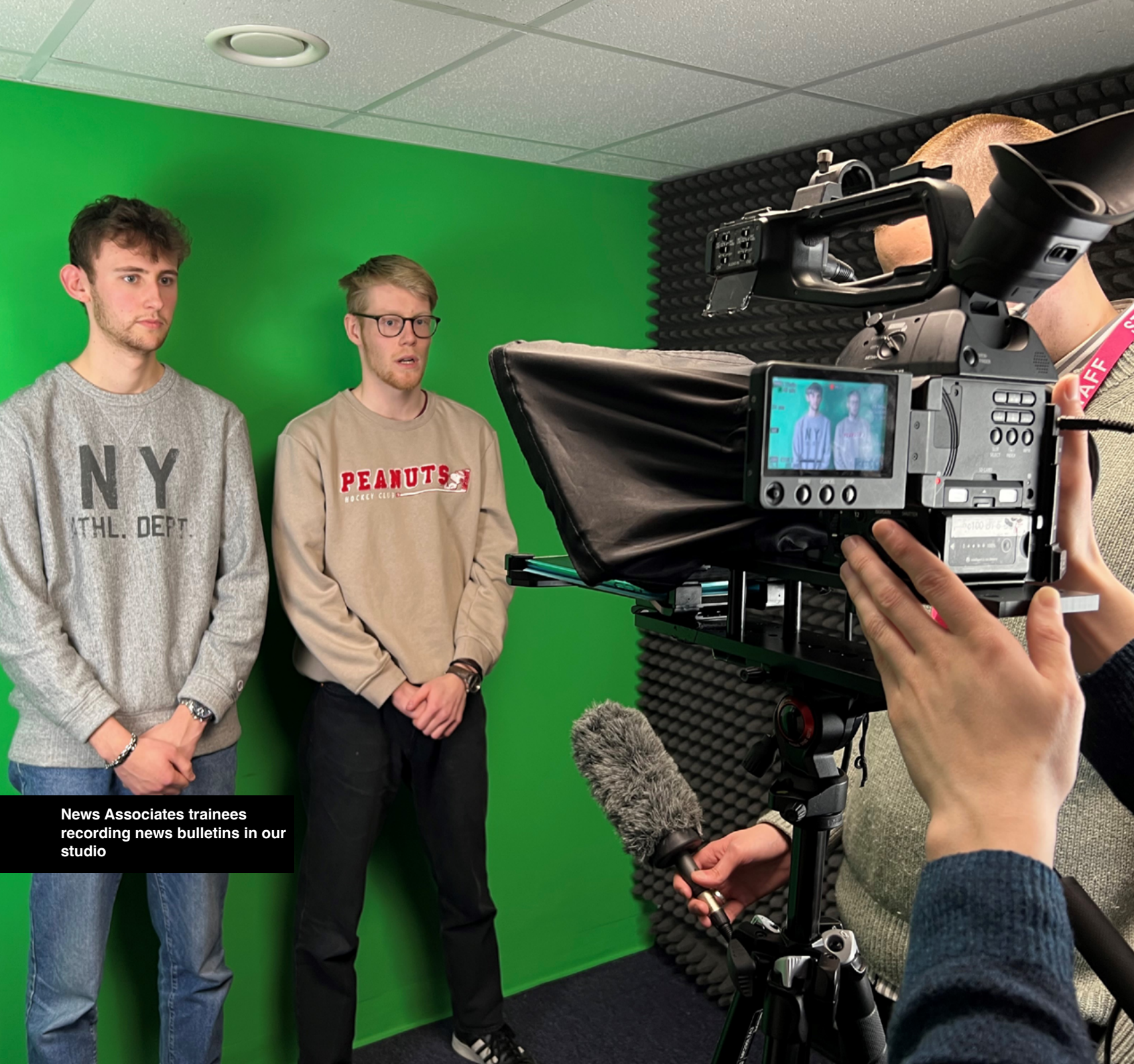
News Associates trainees recording news bulletins in our studio