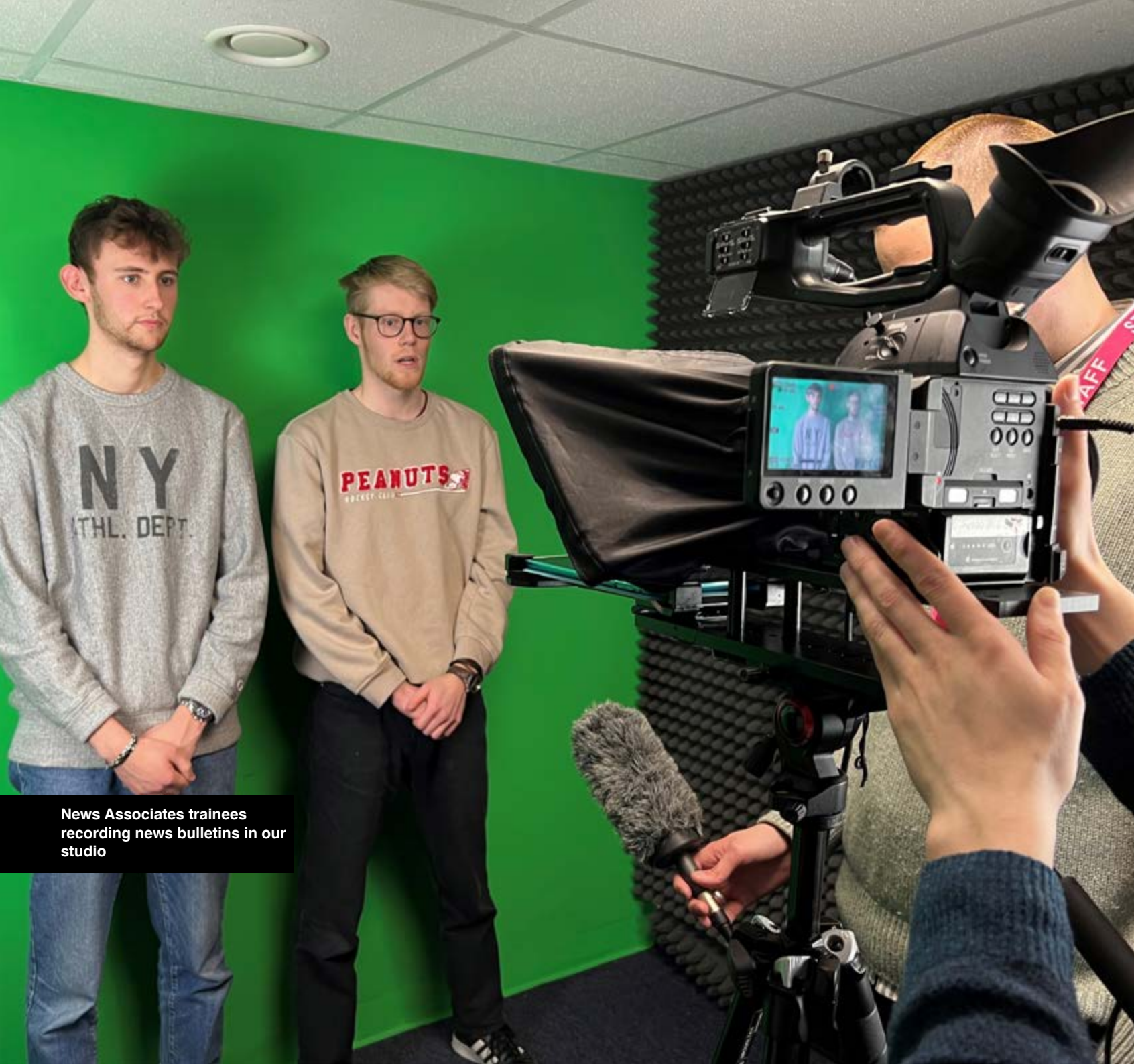
News Associates trainees recording news bulletins in our studio