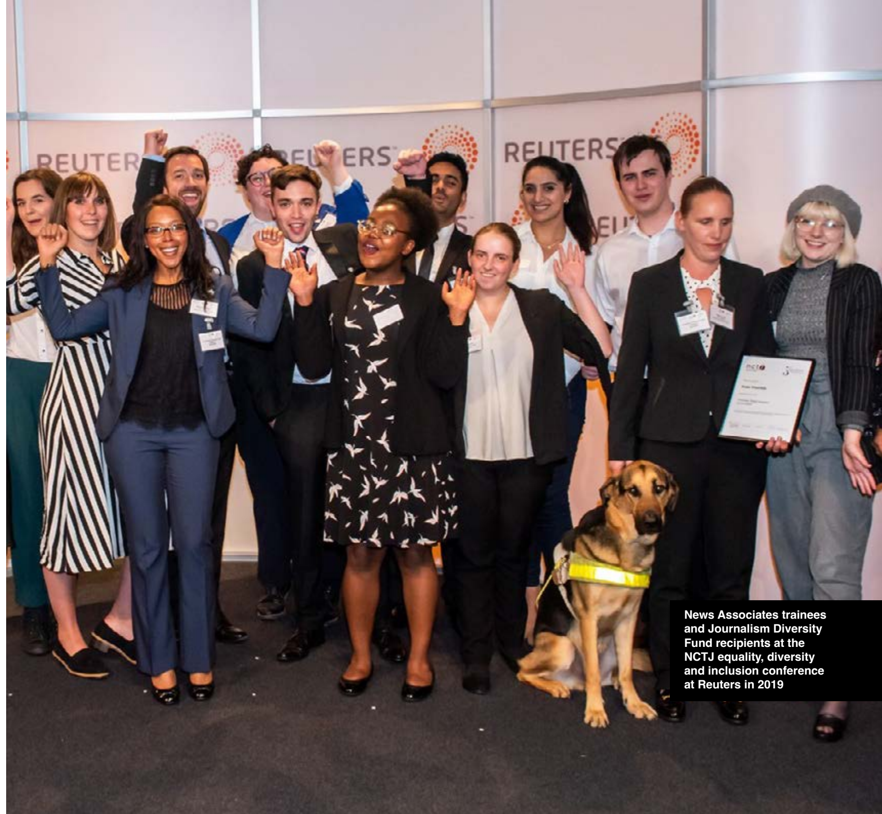
News Associates trainees and Journalism Diversity Fund recipients at the NCTJ equality, diversity and inclusion conference at Reuters in 2019

You can also find us on Twitter, Facebook and LinkedIn.