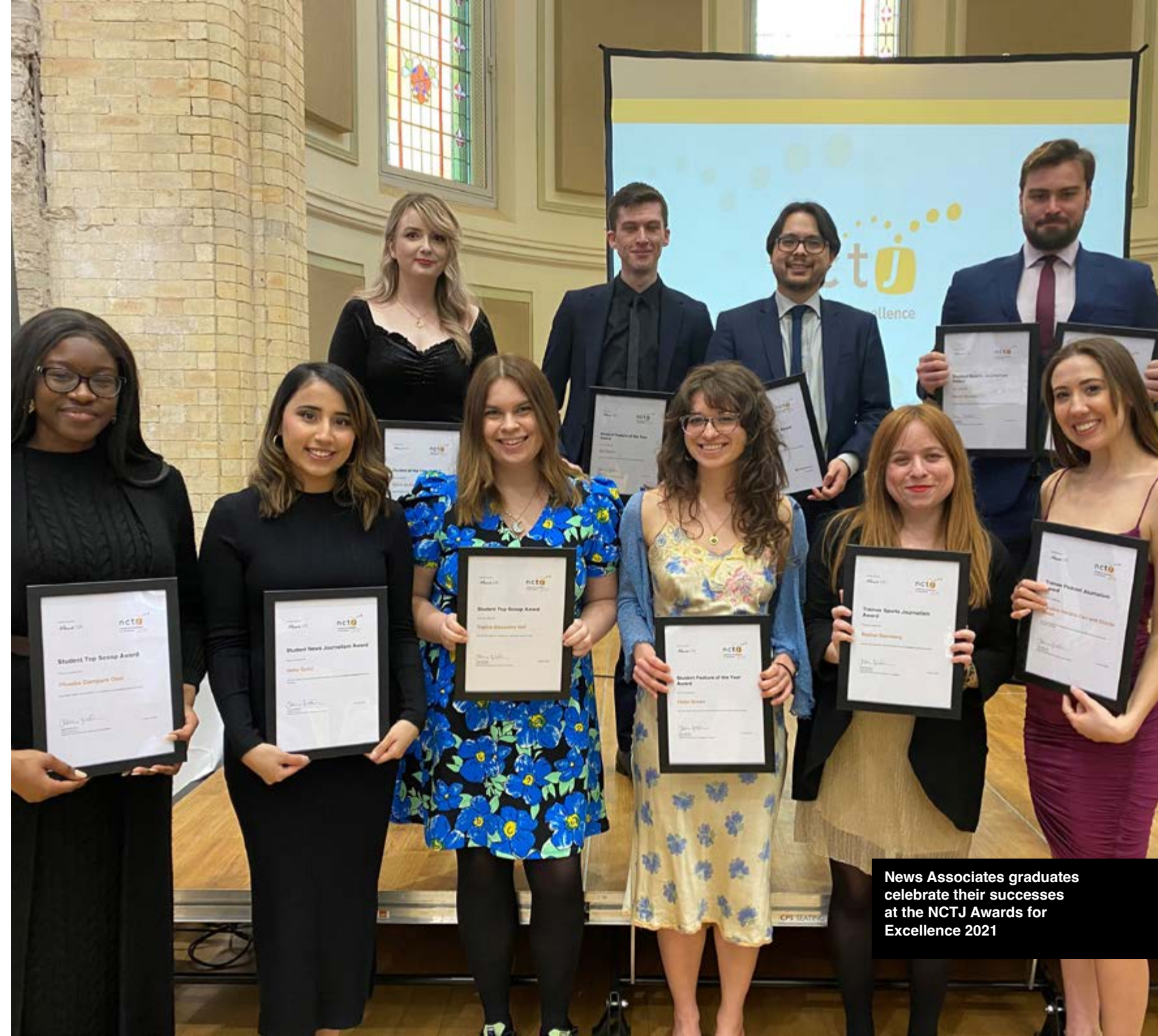
News Associates graduates celebrate their successes at the NCTJ Awards for Excellence 2021

Our remote part-time course has an intake in November. Lessons are held every Tuesday 6:30pm-9:30pm and every other Thursday 6:30pm-9:30pm. This course will be fully taught on Zoom.