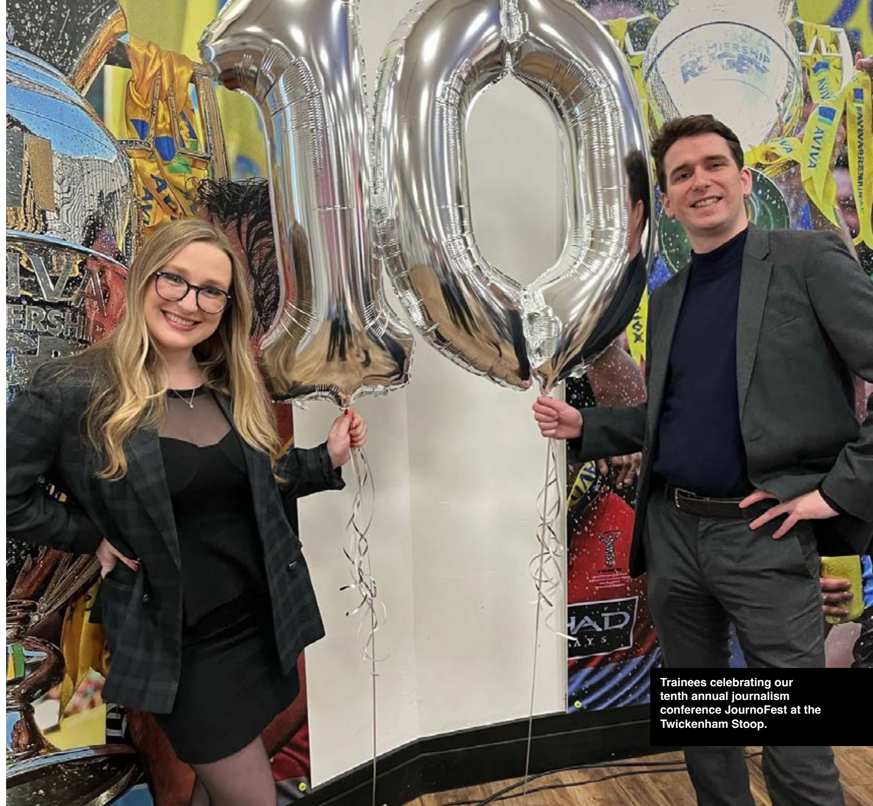
Trainees celebrating our tenth annual journalism conference JournoFest at the Twickenham Stoop.

You are welcome to sit exams with us in London and join us for journalism work placement on Wednesdays, but that is entirely optional.