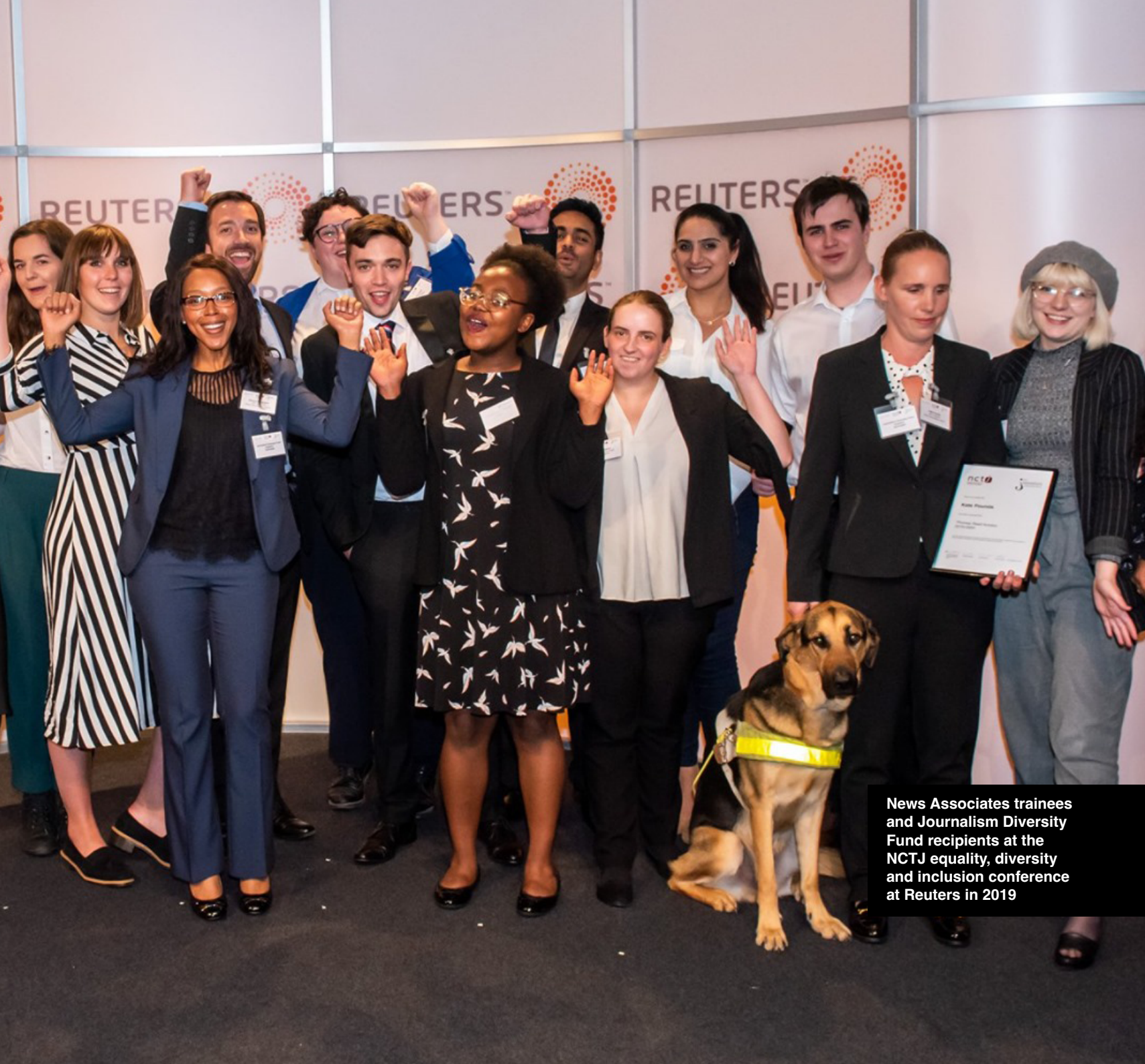
News Associates trainees and Journalism Diversity Fund recipients at the NCTJ equality, diversity and inclusion conference at Reuters in 2019

You can also find us on Twitter, Facebook and LinkedIn.