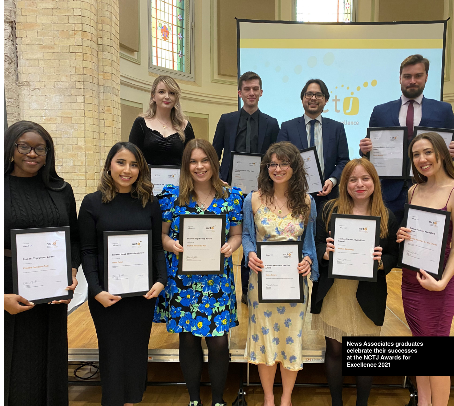
News Associates graduates celebrate their successes at the NCTJ Awards for Excellence 2021

Our remote part-time course has an intake in November. Lessons are held every Tuesday 6:30pm-9:30pm and every other Thursday 6:30pm-9:30pm. This course will be fully taught on Zoom.