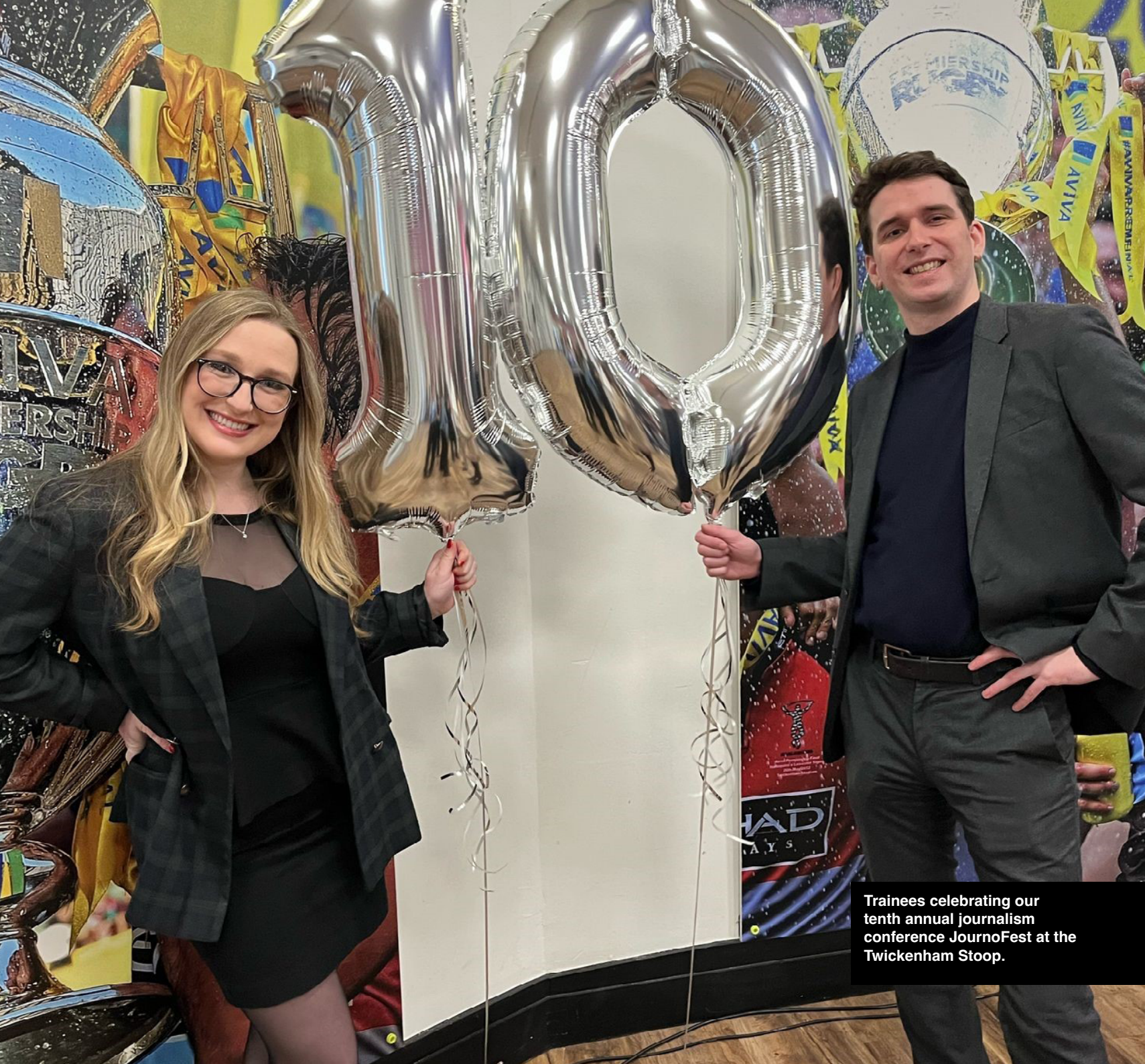
Trainees celebrating our tenth annual journalism conference JournoFest at the Twickenham Stoop.

You are welcome to sit exams with us in London and join us for journalism work placement on Wednesdays, but that is entirely optional.