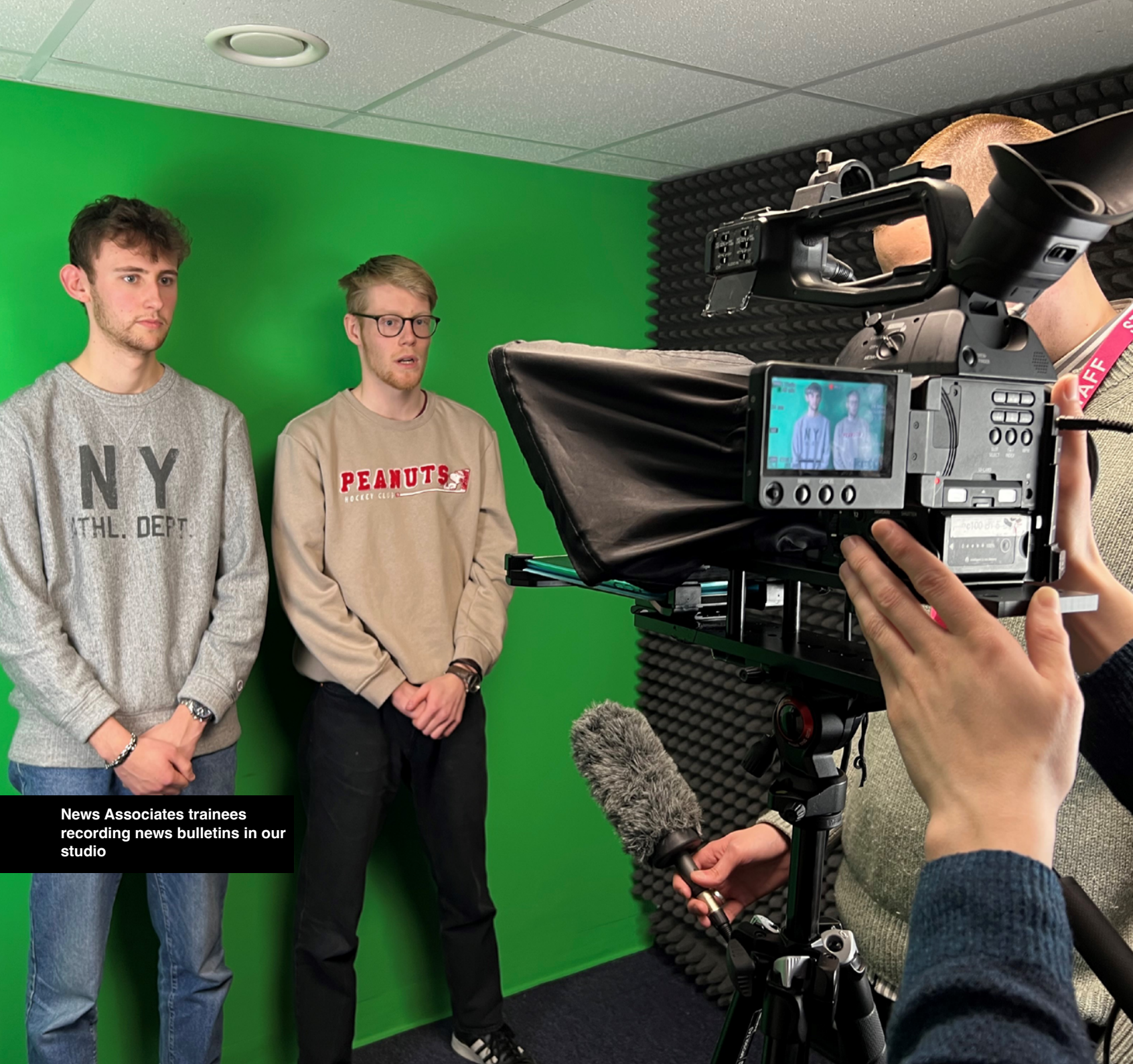
News Associates trainees recording news bulletins in our studio