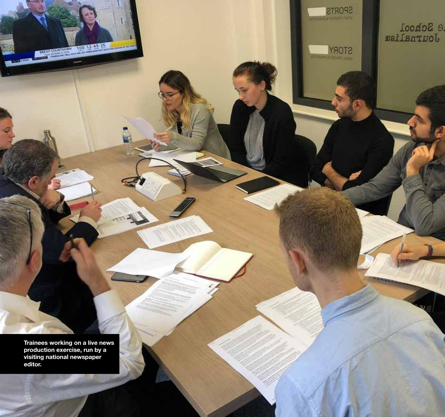
Trainees working on a live news production exercise, run by a visiting national newspaper editor.