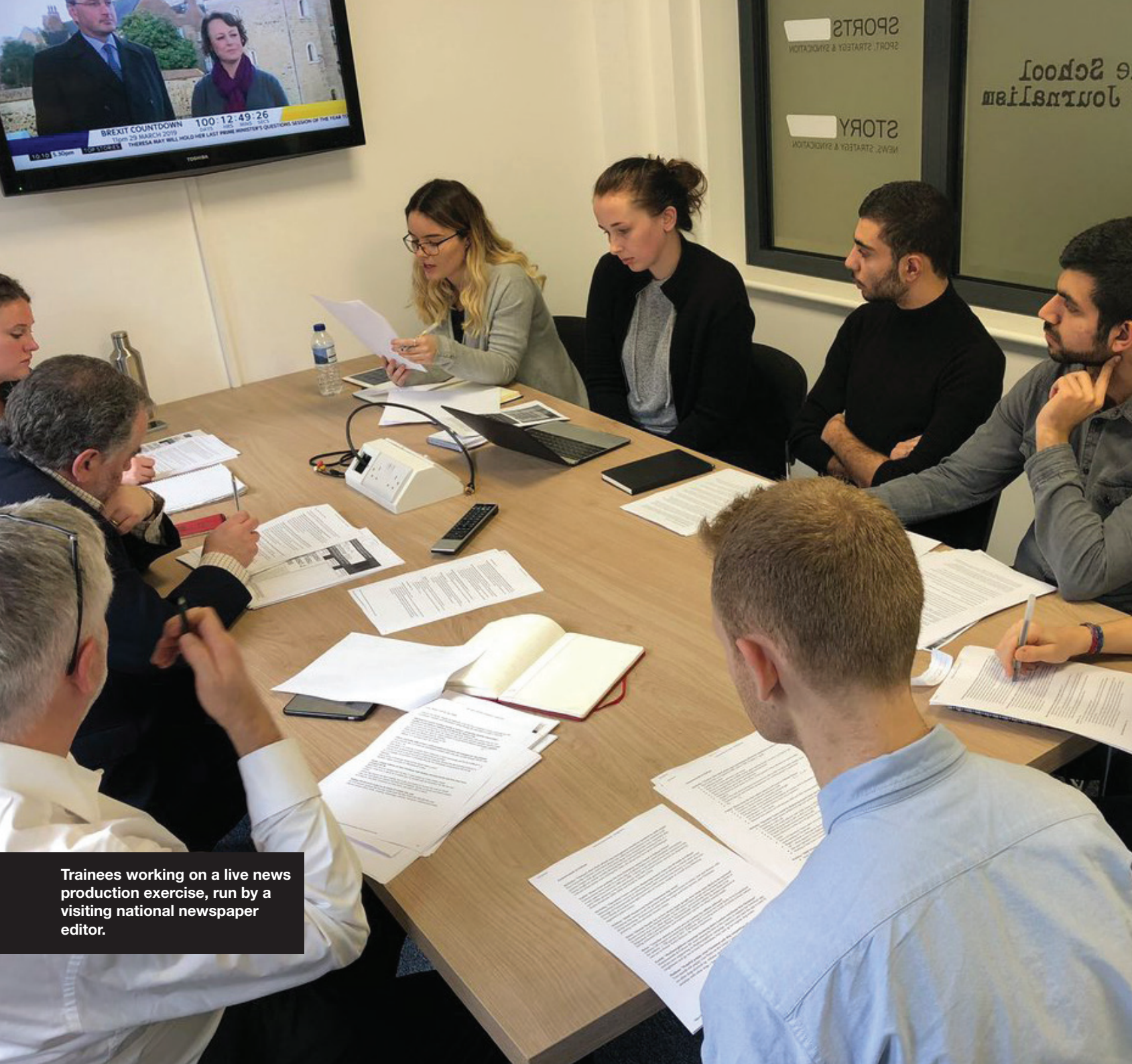
Trainees working on a live news production exercise, run by a visiting national newspaper editor.