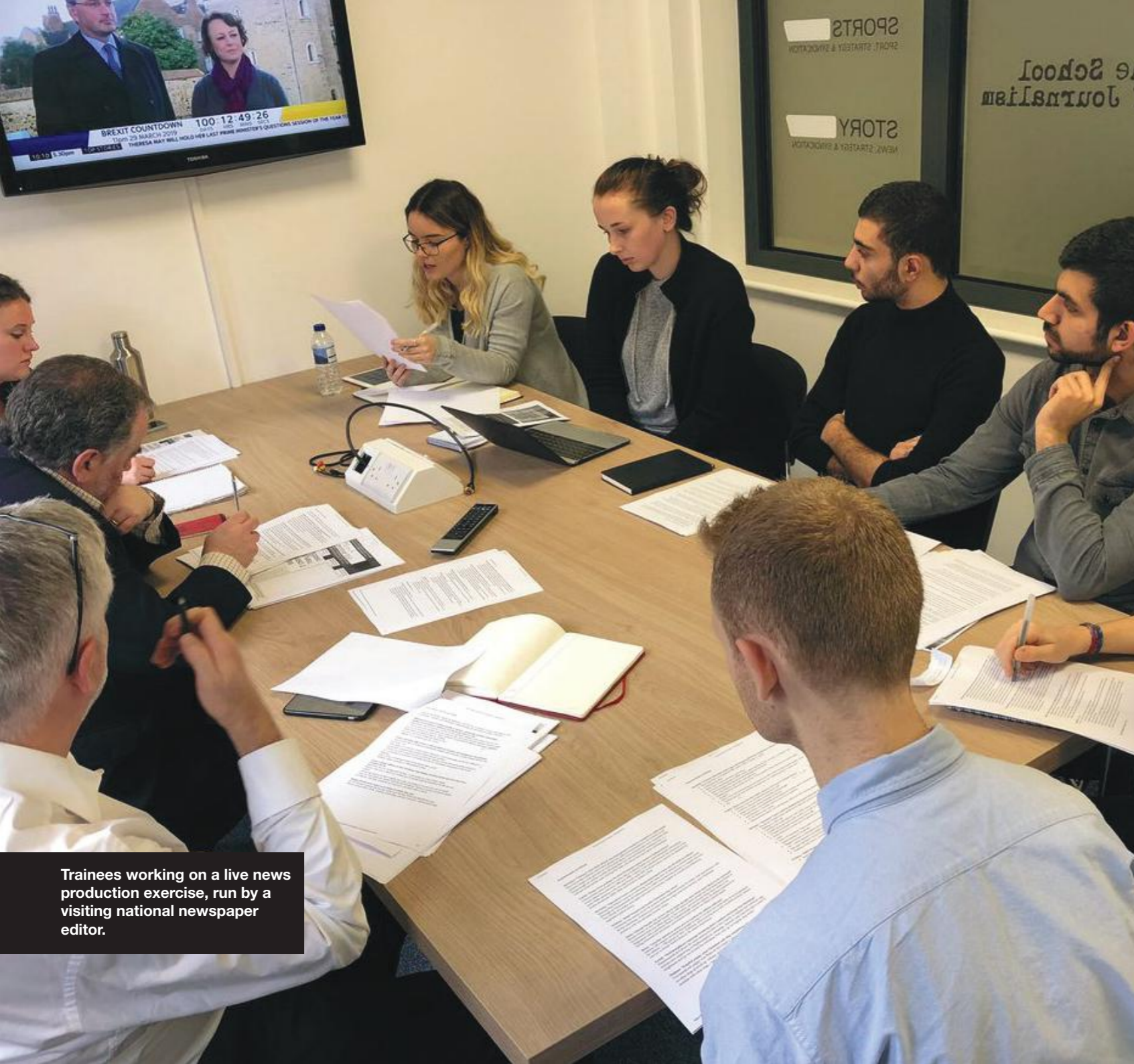
Trainees working on a live news production exercise, run by a visiting national newspaper editor.